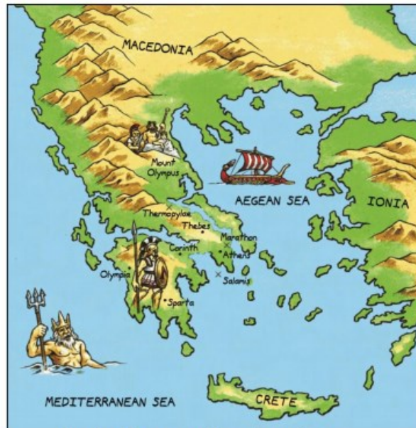
Ancient Greece and nearby regions